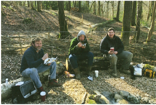
Baked potatoes round the firepit