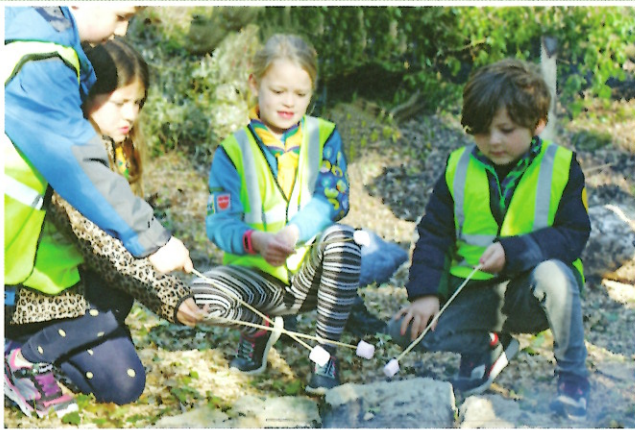
Mayfield Beavers toasting marshmallows